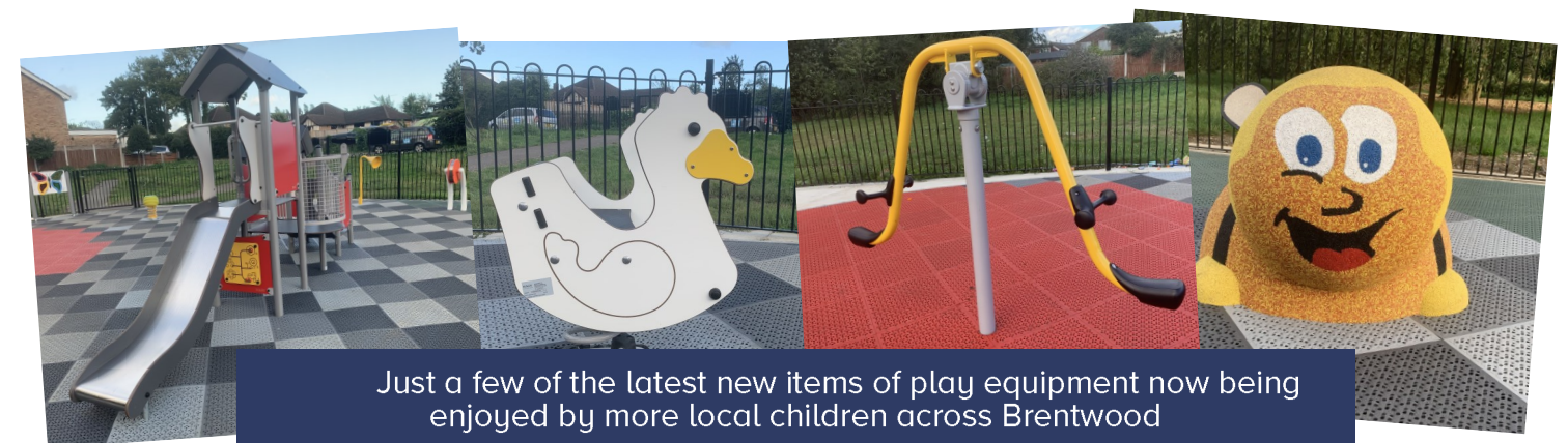
Just a few of the latest new items of play equipment now being enjoyed by more local children across Brentwood

Work has recently been completed on the refurbishment of the toddler play areas at King Georges Playing Fields and River Road in South Weald. These play areas were opened on 11 th July and have been very well received by children and parents. Further refurbished play areas will be completed later this financial year, including Hutton. The play areas are accessible so they can be enjoyed by all.