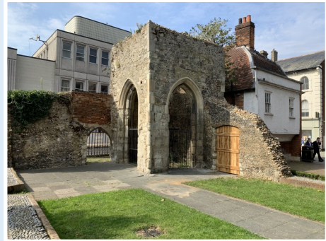
The Chapel Ruins are an iconic part of Brentwood's history.

The Ruins of the Old Chapel of St Thomas a Becket received a welcome set of improvements recently thanks to Brentwood Borough Council. A pair of Oak door facades