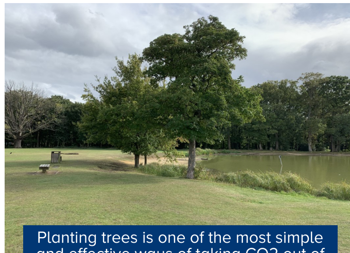
Planting trees is one of the most simple and effective ways of taking CO2 out of the atmosphere to help the environment.

We are also working with partners such as Essex County Council to identify additional locations where we can plant trees of the appropriate species that will both enhance the environment and increase carbon absorption. With tough objectives to achieve Zero Carbon in South Essex by 2040 it is important that we work in partnership with organisations such as The Woodland Trust and The Forestry Commission to achieve the right levels of planting.