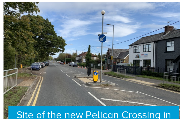
Site of the new Pelican Crossing in Roman Road , Mountnessing

"The safety of children is absolutely paramount and your Conservative Councillors are delighted that we have been able to get the pelican crossing approved and financed. The crossing will be a huge safety benefit for children, parents and residents and is much welcomed." - Jon Cloke