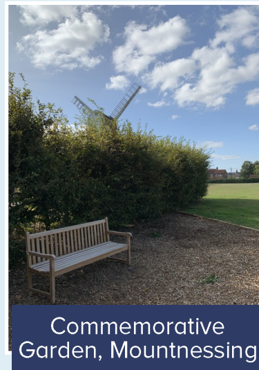
Commemorative Garden, Mountnessing

This is great news for Mountnessing villagers as the new garden is already a popular place to visit.