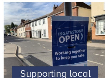
Supporting local traders