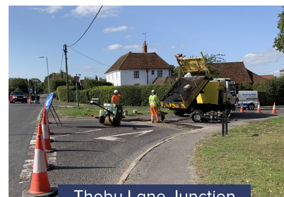
Thoby Lane Junction