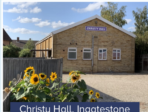
Christy Hall, Ingatestone

Christy Hall will benefit from £1,232 which was requested by the Trustees of Christy