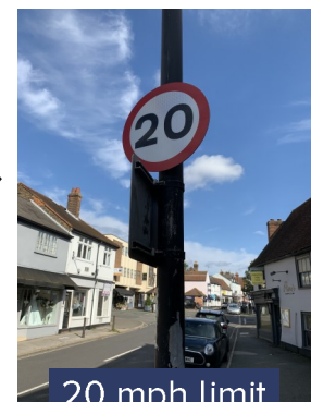
20 mph limit

Here in Ingatestone, Fryerning and Mountnessing we saw a terrific response from residents and local organisations. So a big thank you to all the individuals, community groups and charities who have actively supported their communities. It clearly remains important that everyone stays alert over the coming months.