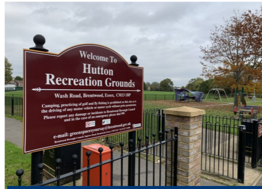
The Children's Play Area at Hutton Recreation Fields will get new and accessible play equipment in 2021.