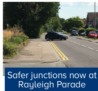
Safer junctions now at Rayleigh Parade

Last year Hutton County Councillor Louise McKinlay led a meeting with Essex Highways to look at what could be done to improve the safety of drivers turning right out of Fielding Way into Rayleigh Road. Too often the visibility was impaired by cars that had parked on the pavement near to the parade of shops. As a result the double yellow lines were installed near the junction and the situation is now much better for drivers. This year Louise was also able to get double yellow lines