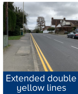
Extended double yellow lines

introduced along Rayleigh Road to prevent the parking that was taking place - especially from football match supporters. Both restrictions have led to a significant safety improvement for car drivers and pedestrians alike.