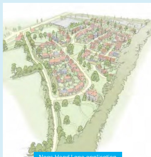
Nags Head Lane application

Once the data is available Highways have agreed to meet Lesley and I on site to discuss options for addressing problem speeding. I'll update you as soon as I have more information.