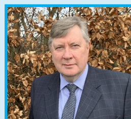
ROGER HIRST PFCC

Police, Fire & Crime Commissioner for Essex 01245 291 600